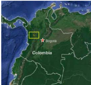
Location: De Los Andes Cooperative

More than four hundred smallholder farmers in the municipality of Jardín in Colombia have chosen 4C certification to grow coffee more productively and sustainably. They are all members of the De Los Andes Cooperative, a non-profit organization founded in 1961, which is committed to ensure that growers receive a fair share for their effort. The cooperative is located in Andes, Antioquia, one of the major coffee growing regions of Colombia.