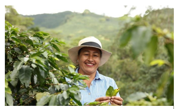
Figure 3: Colombian coffee farmer

Within these seven departments, ABC conducted a detailed baseline study and provided the project with key information that allows strengthening the impact, sustainability, scope and quality of the project interventions. The study identified social, environmental and economic challenges that make coffee production risky and volatile as well as unappealing for young adults. Further, possible target regions for project implementation and main topics for the project's training program were identified.