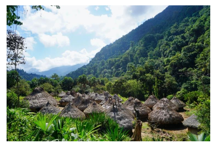
Figure 2: Department Magdalena, Colombia

of the Sierra Nevada de Santa Marta, where the department has ecosystems and climatic conditions suitable for coffee. On average, the coffee farms have a planted area of 2.76 hectares, with an average age of coffee plantations of twelve years and an estimated proportion of 4% of coffee growers under 30 years of age.