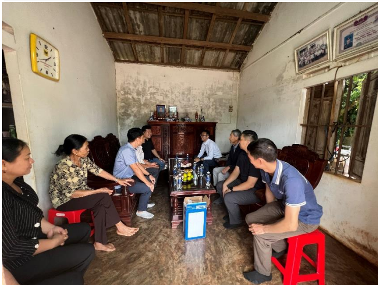
Visit Farmer in Daklak province